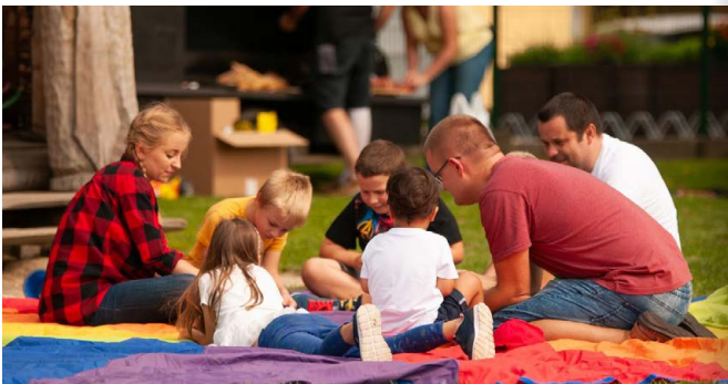
The Summer picnic! Lynka parents and their children meet for a day of sport, BBQ and fun-in-the-sun