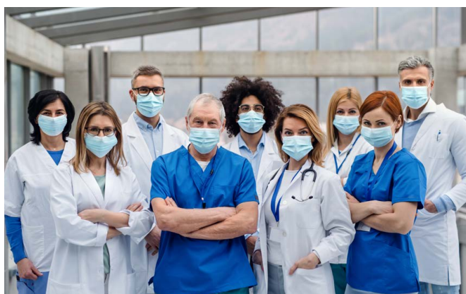
Lynka donated face masks to the patients and staff of Children's hospitals in Krakow and Warsaw.