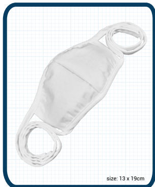
size: 13 x 19cm

Reusable consumer face masks made from a 3-ply filtering fabric with polyester tie-back cord. The inner layer is OEKO-TEX certified 100% cotton soft fabric on the skin. The middle layer is a filter layer (PN-EN 689) which filters dust and other particulate matter, with a filtration capacity of 96% at 6h exposure. The outer layer is a durable non-woven polypropylene for increased filtration of small particles and added protection. "Venice" is made from two fabric panels, which creates a conical shape with a seam down the middle. One can print on either side of the seam, but not directly on the seam.