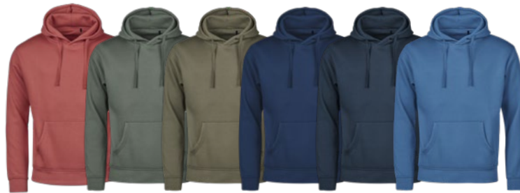
CRANBERRY LEAF GREEN MOSS NAVY INK OCEAN BLUE