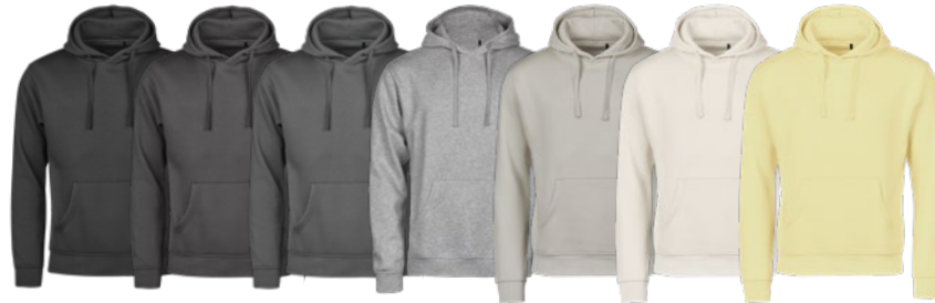
BLACK DARK GREY POWDER GREY HEATHER GREY CEMENT ECRU SUNSHINE