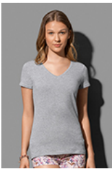
ST9710 Claire V-neck