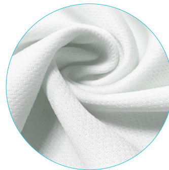
C | Coolmax® micro bird eye