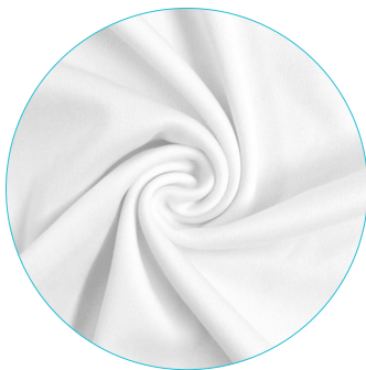
A | Single jersey polyester