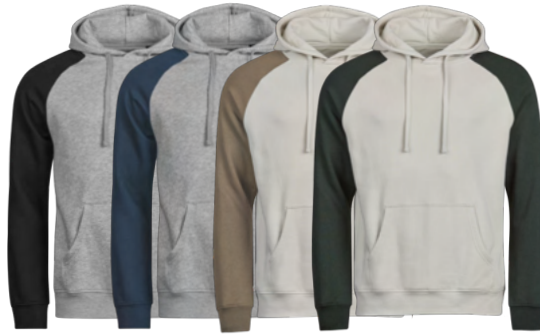
HEATHER GREY/ BLACK